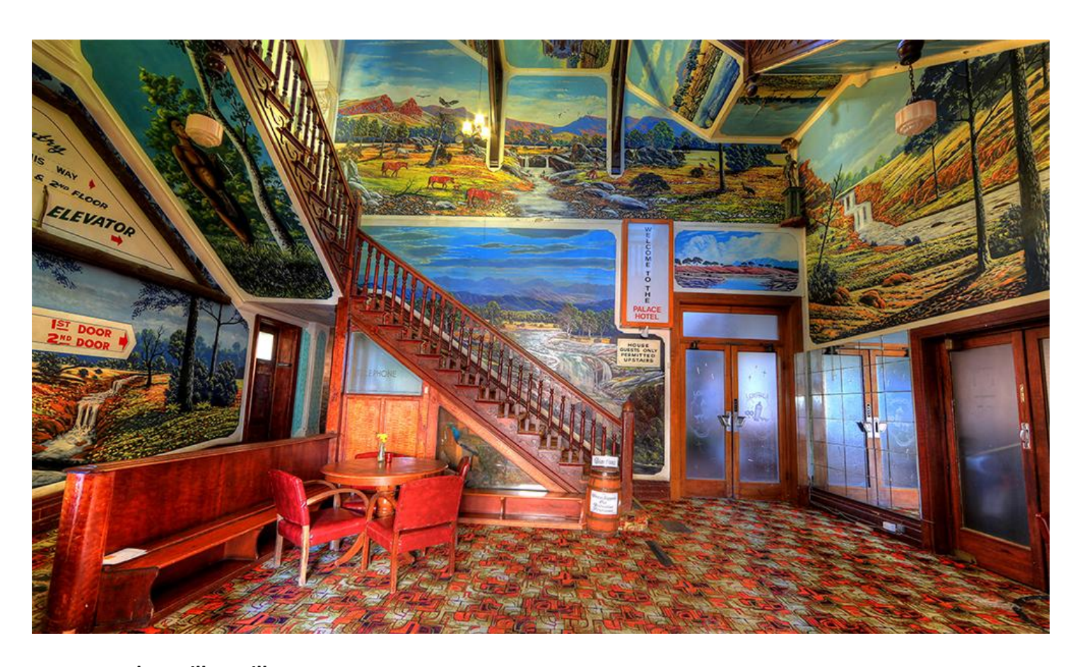
Day 5 - Broken Hill to Hillston

Meet your guide after breakfast this morning as we continue our journey travelling South East to Hillston. We travel along the Menindee Road towards the stunning Lake Menindee, our first stop of the day. Menindee is the oldest European settlement in Western New South Wales and was the first town established on the Darling River. The explorers Burke and Wills also stopped here on their expedition to Northern Australia. We have some time to explore the town as well as see the Maidens Arms Hotel, the pub where Burke and Wills visited. Rejoining the vehicle, we continue along the Menindee Road towards Ivanhoe, a small town with a population of just 200 people. Lunch today is at the tiny Ivanhoe Hotel. Relax with a beer and some great outback hospitality.