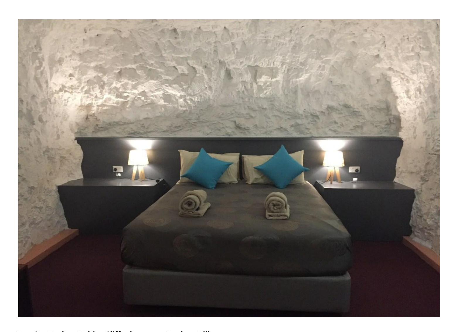
Day 3 – Explore White Cliffs then onto Broken Hill

Settle in and chat to some of the friendly locals.